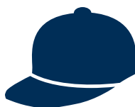
Wear a Hat